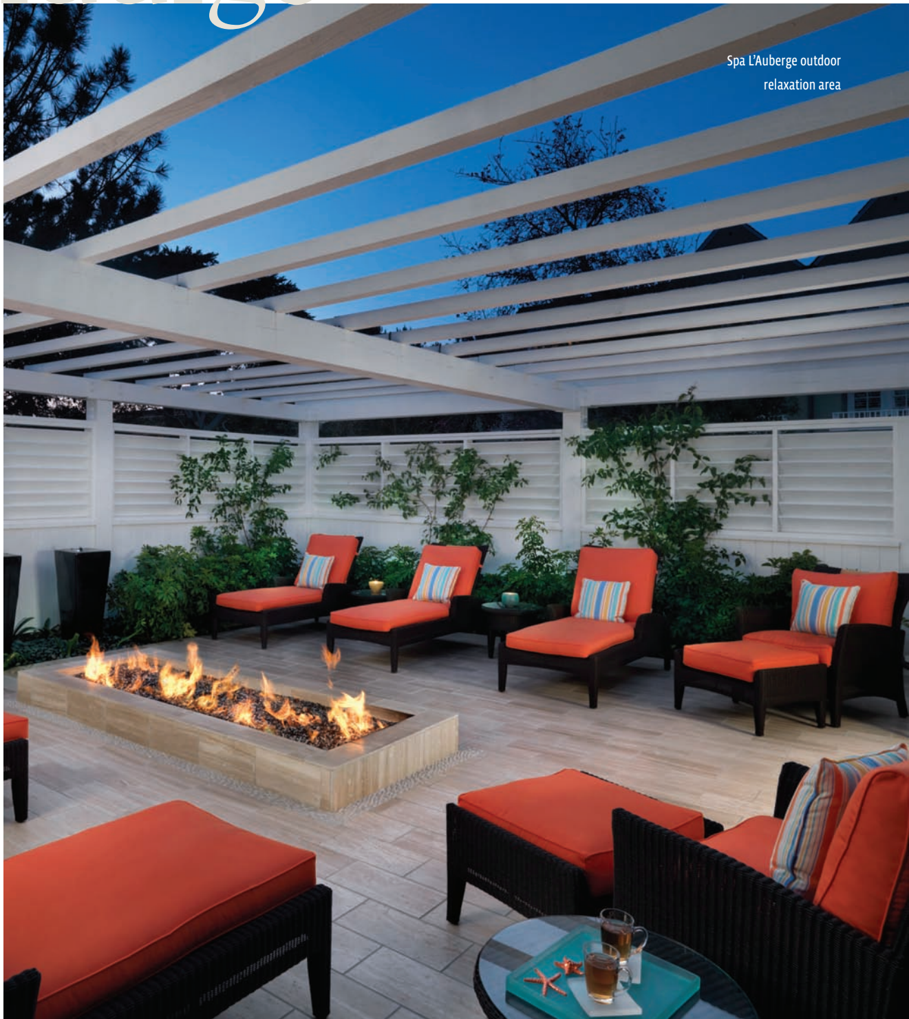
Spa L'Auberge outdoor relaxation area

Serene Seaside Spa L'Auberge Del Mar has unveiled its new 5,000-square-foot freestanding Spa L'Auberge, set in a quaint, beach cottage ambiance. The spa pampers all the senses, offering indoor and outdoor relaxation areas, aromatic steam rooms, soothing yet uplifting décor, and ten treatment rooms where a diverse selection of therapies are given including their new signature Seaside Sojourns. Try the Moroccan Adventure, a purifying escape in which the entire body is covered with spices and clays, cocooned, and then massaged with warm jasmine oil. Complimentary hotel valet parking is available to guests visiting the spa, as is pool and Jacuzzi access. (858/793-6493, www.spalauberge.com ) MIA STEFANKO